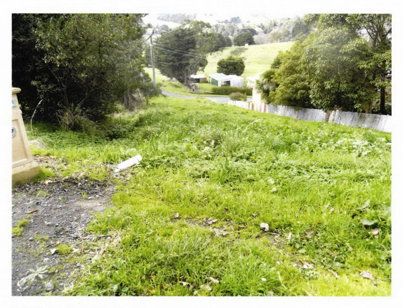
Unfinished section of Wills Street.