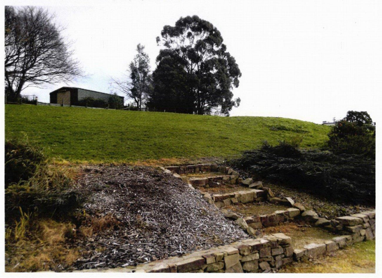
Possible house site for Lot 1