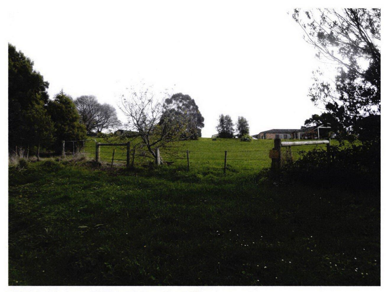
Property and access point from lower section of Wills Street