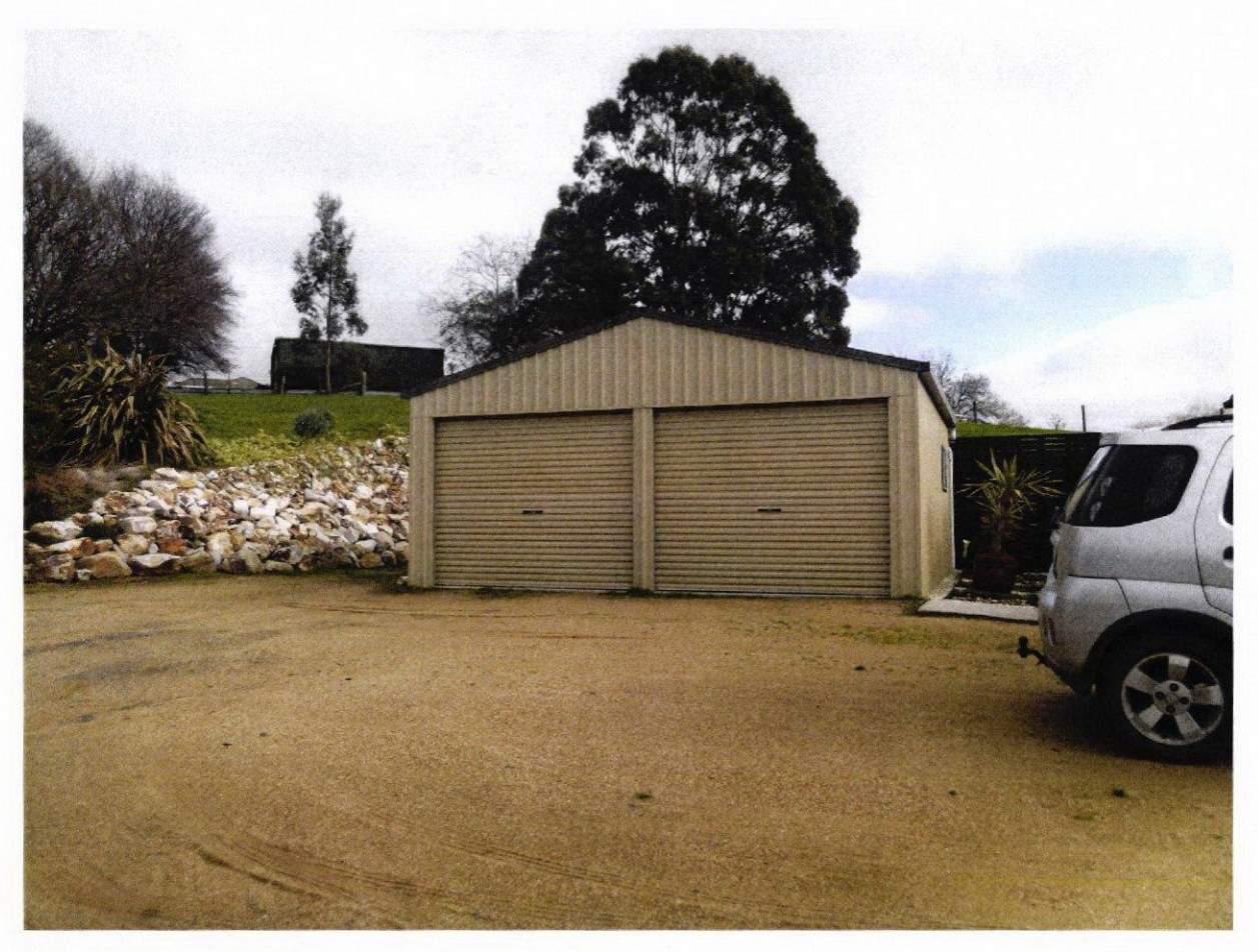
Current garage on site