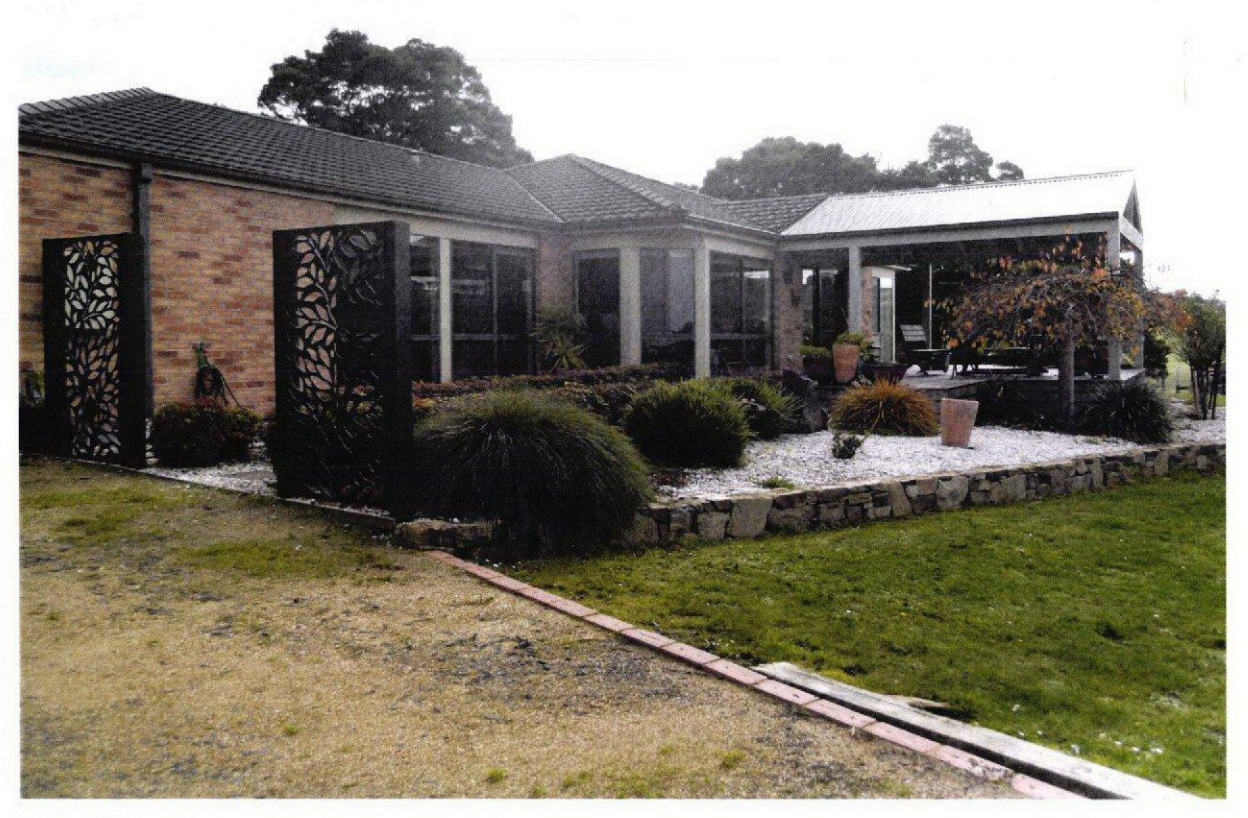
Current dwelling on site