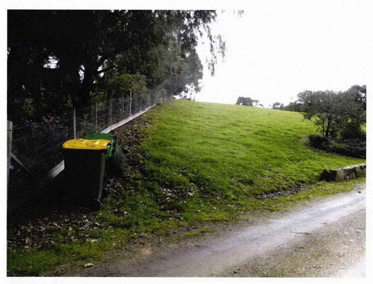
Access point for new driveway to proposed Lot 1